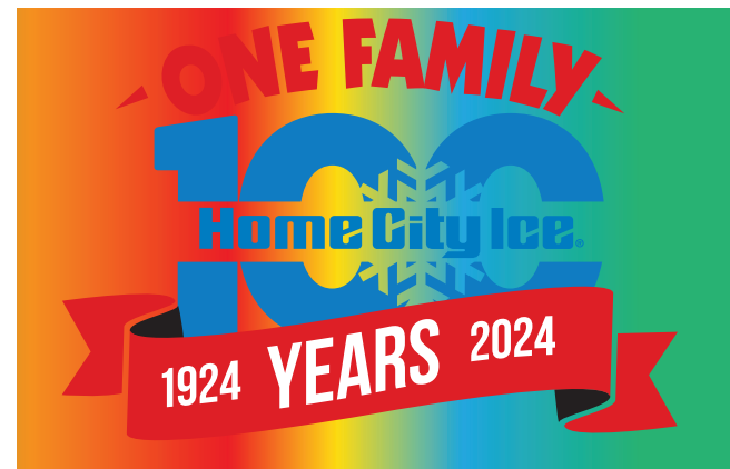
Do not use Busy Background