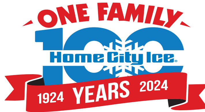
Do not Stretch