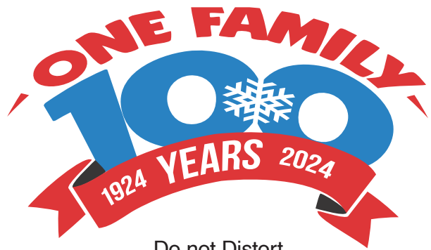
Do not Distort

Maintaining consistent logo appearance is crucial. Below are examples of unacceptable variations for each specific scenario.