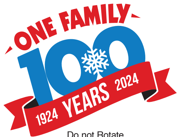
Do not Rotate